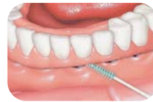
Implants, as they are wire-free and do not scratch