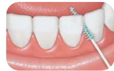
Healthy Gums (Non-compliant flossers)